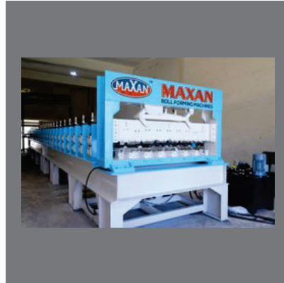
Color Coated Sheet Roll Forming Machine