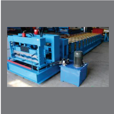
Roof Tile Roll Forming Machine