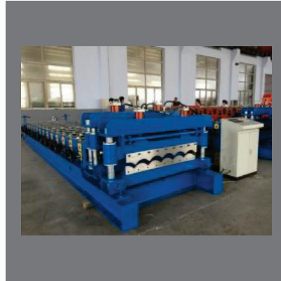
MAXAN Glazed Tile Roll Forming Machine