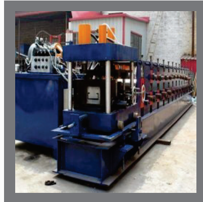
C Channel Roofing Machine