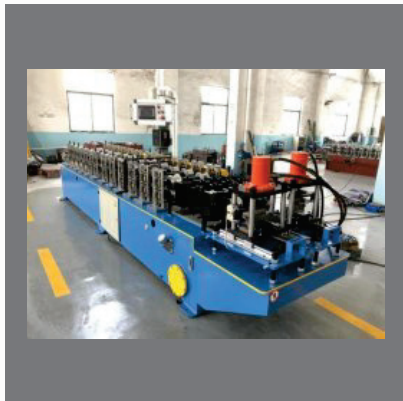
C Z Purlin ROLL FORMING MACHINE