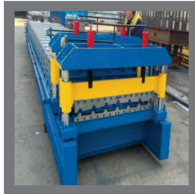
Metal Roll Forming Profile Machine