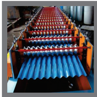
CORRUGTION Roofing Sheet Making Machine