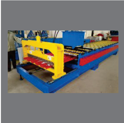
MAXAN Corrugated Roofing Sheet Making Machine