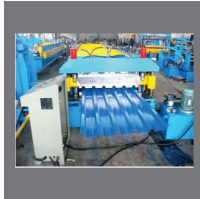
PR Coated Roofing Sheet Making Machine