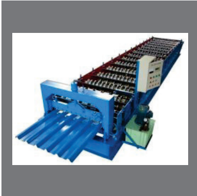
Metal Roofing Machine