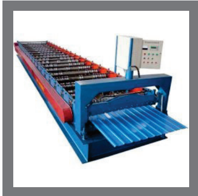
Automatic Roof Sheet Roll Forming Machine