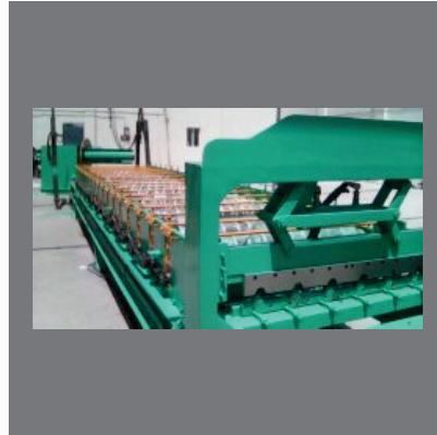
Industrial Roll Forming Machine